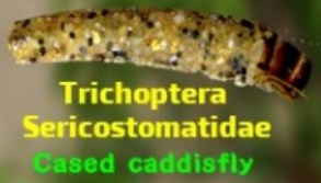
Trichoptera Sericostomatidae Cased caddisfly