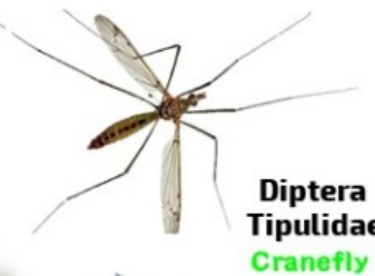
Diptera Tipulidae Cranefly