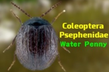
Coleoptera Psephenidae Water Penny