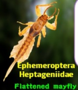
Ephemeroptera Heptageniidae Flattened mayfly