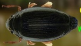
Coleoptera Gyrinidae Whirligig beetle