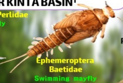
Ephemeroptera Baetidae Swimming mayfly