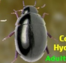
Coleoptera Hydrophilidae Adult water beetle

1 Based on Upper Kinta Biodiversity Assessment Report under UNDP-GEF5 project on Mainstreaming Biodiversity in River Management