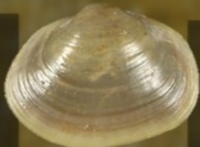
Sphaeriidae Pea Cackle