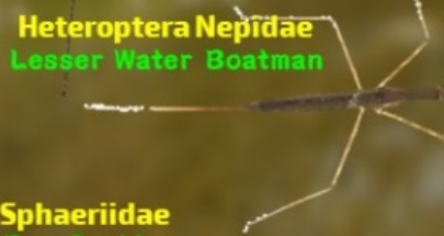
Heteroptera Nepidae Lesser Water Boatman