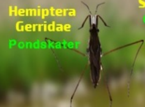
Hemiptera Gerridae Pondskater