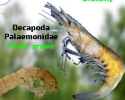
Decapoda Palaemonidae River prawn