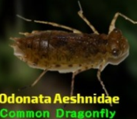
Odonata Aeshnidae Common Dragonfly