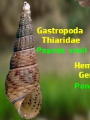
Gastropoda Thiaridae Pagoda snail