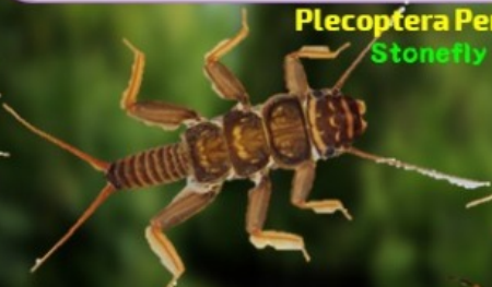
Plecoptera Perlidae Stonefly