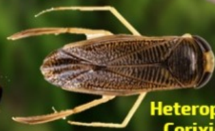
Heteroptera Corixidae Water stick insect