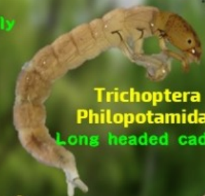
Trichoptera Philopotamidae Long headed caddisfly