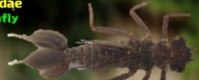
Megaloptera Corydalidae Dobsonfly