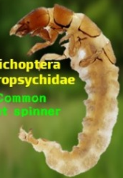
Trichoptera Hydropsychidae Common net spinner