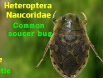
Heteroptera Naucoridae Common soucer bug