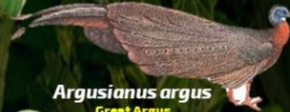
Argusianus argus Great Argus