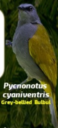
Pycnonotus cyaniventris Grey-bellied Bulbul