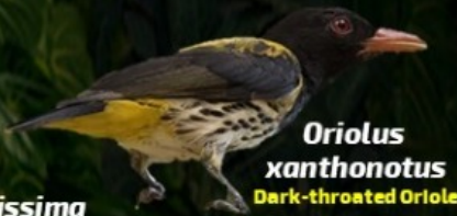
Oriolus xanthonotus Dark-throated Oriole