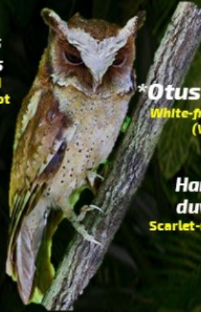
*Otus sagittatus White-fronted Scops-owl (Vulnerable)