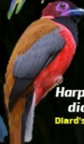
Harpactes diardi Diard's Trogon