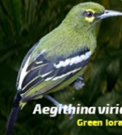
Aegithina viridissima Green Iora