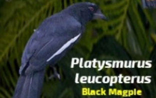
Platysmurus leucopterus Black Magpie