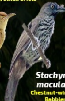
Stachyris maculate Chestnut-winged Babbler