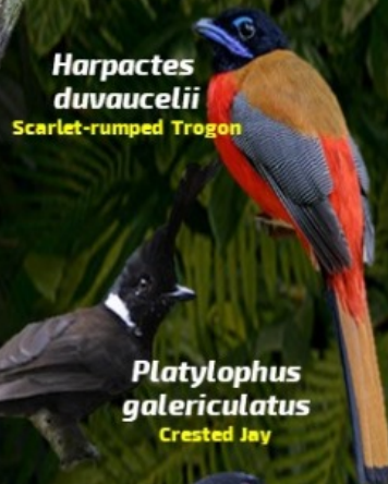
Harpactes duvaucelii Scarlet-rumped Trogon