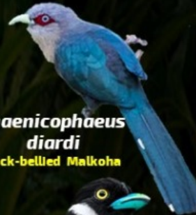
Phaenicophaeus diardi Black-bellied Malkoha