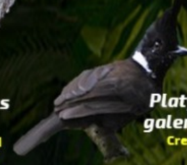
Platylophus galericulatus Crested Jay