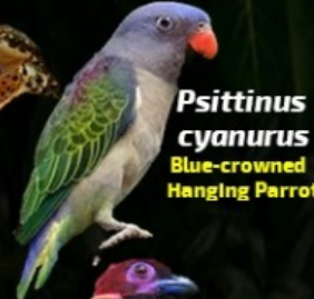
Psittinus cyanurus Blue-crowned Hanging Parrot