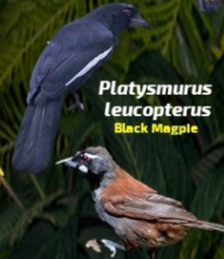
Stachyris nigricollis Black-throated Babbler

1 Based on Upper Kinta Biodiversity Assessment Report under UNDP-GEFS project on Mainstreaming Biodiversity in River Management