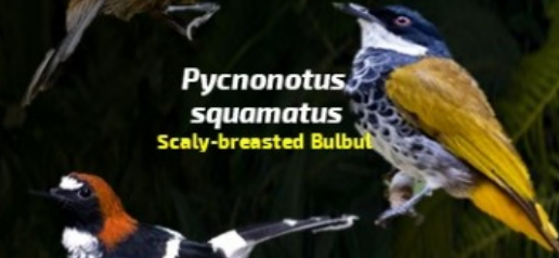
Pycnonotus squamatus Scaly-breasted Bulbul