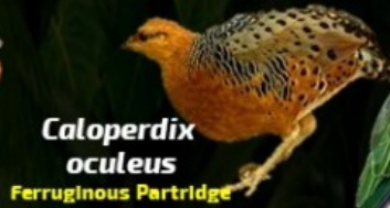
Caloperdix oculus Ferruginous Partridge