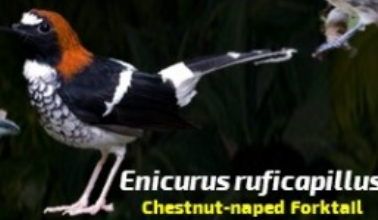
Enicurus ruficapillus Chestnut-naped Forktail