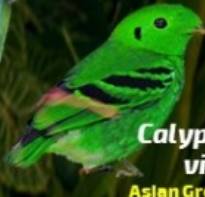
Calyptomena viridis Asian Green Broadbill